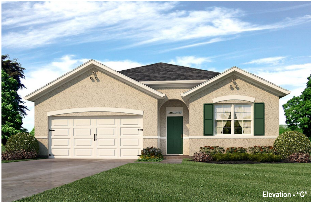
Elevation - "C"