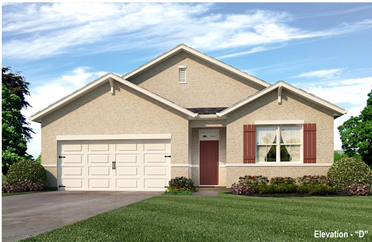
Elevation - "D"

The Cali 3-4 Bedroom | 2 Bath | 2 Car Garage 1,828 Square Feet*