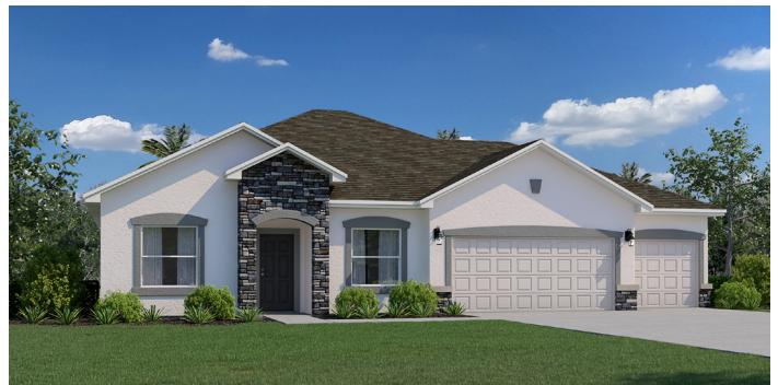
Architectural Style B - Stone