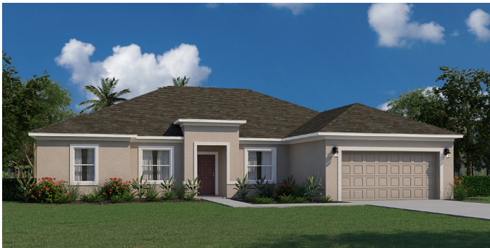
Architectural Style A