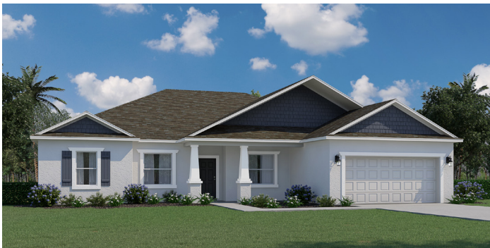
Architectural Style B