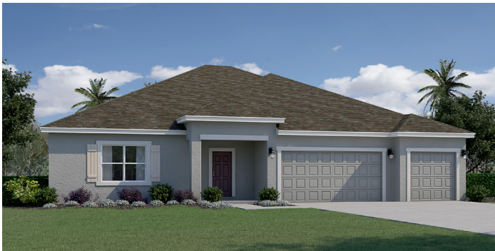
Architectural Style A