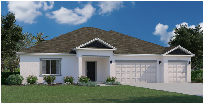
Architectural Style B